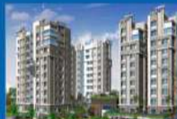
ACTIVE GREENS, KOLKATA