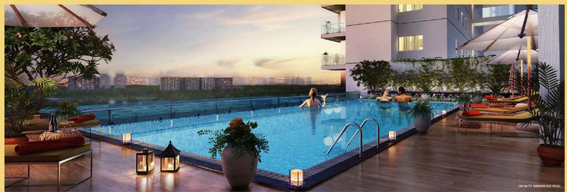
INFINITY SWIMMING POOL