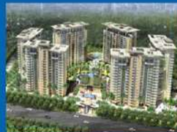
The World Spa, Gurgaon