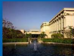
Grand Hyatt Hotel, New Delhi