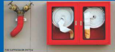
FIRE SUPPRESSION SYSTEM