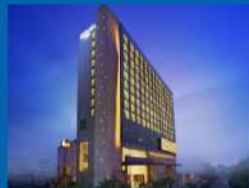
Vivanta by Taj, Gurgaon