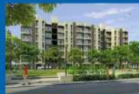
RUCHI LIFESCAPES, BHOPAL