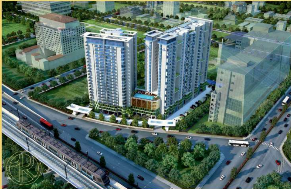
BLOCK C2 & C3 (SERVICE APARTMENTS)