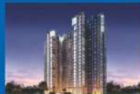
ACTIVE ACRES, KOLKATA