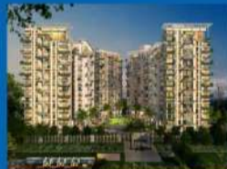
Capitol Heights, Nagpur