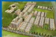
RUCHI LIFESCAPES, INDORE