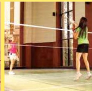
Badminton cum Banquet Hall