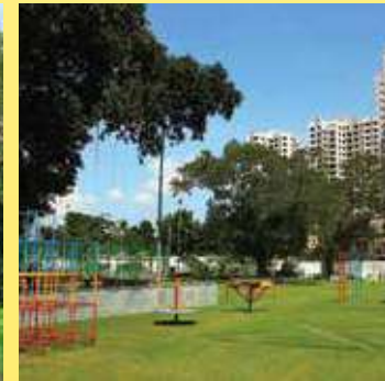
Children's Play Arena