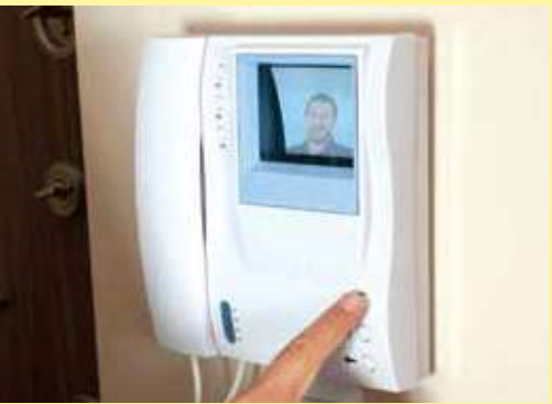
Video Door Phone ▼