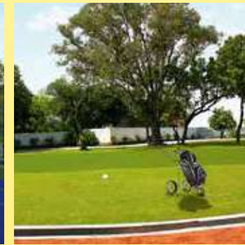
Golf putting green with driving range