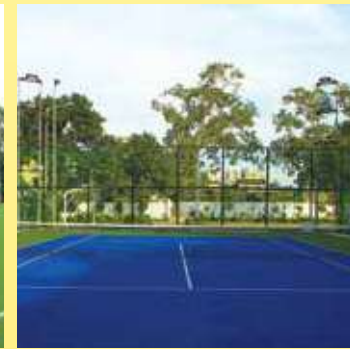
ITF 4 Standard synthetic grass tennis court