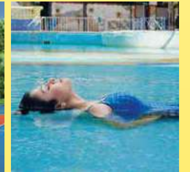
Swimming Pool with Jacuzzi & Kids' Pool