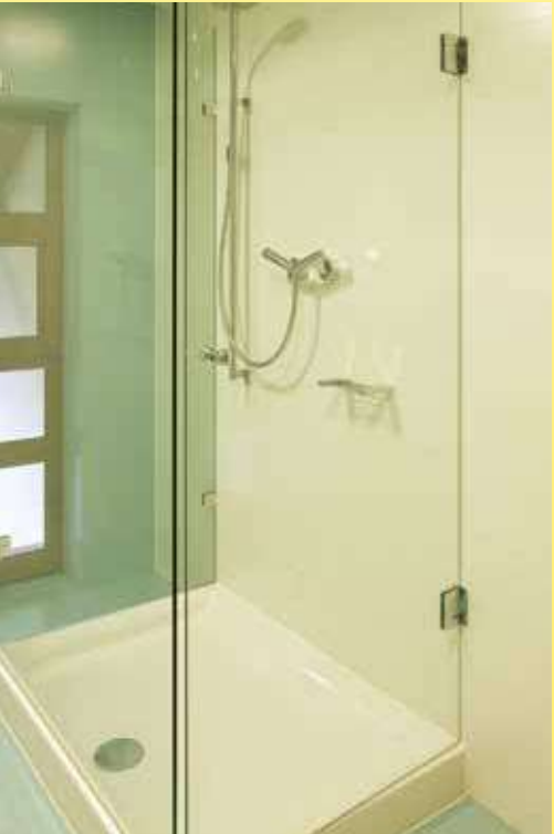
Shower Partition ▼