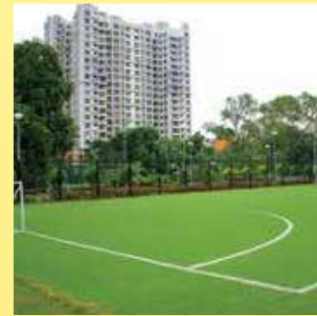
Synthetic grass surface football arena