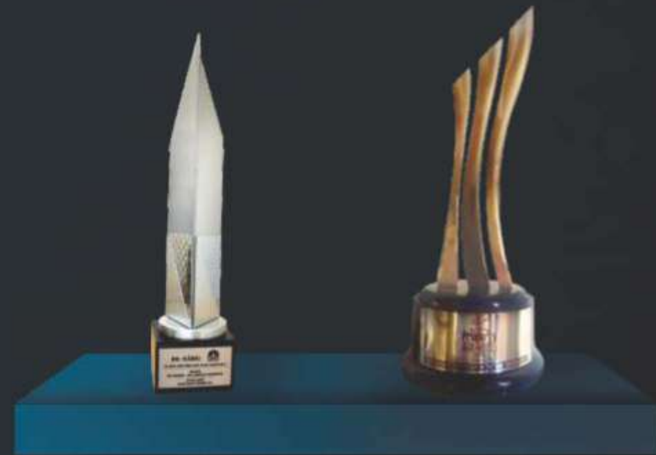
CNBC AWAAZ Real Estate Awards 2013