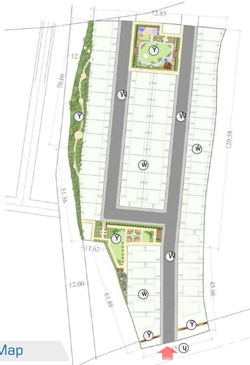
Ruchi Enclave Site Map