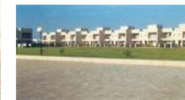
Birla Cellulosic Township