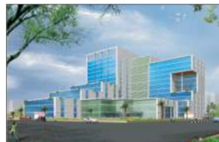
Ruchi IT Park

Ruchi Lifescapes is brought to you by Ruchi Realty Holdings Pvt. Limited, the Group's real estate arm. Utilizing its core strength, Ruchi Realty aims to infuse new life and real meaning into urban spaces and households. Bold and fresh ideas meet the original vision of the group to create brands that enhance life. The company has already launched a mega Condominium Project - Active Acres in Kolkata. Other upcoming projects include an IT Park in Kolkata, an integrated township in Indore, to name a few.