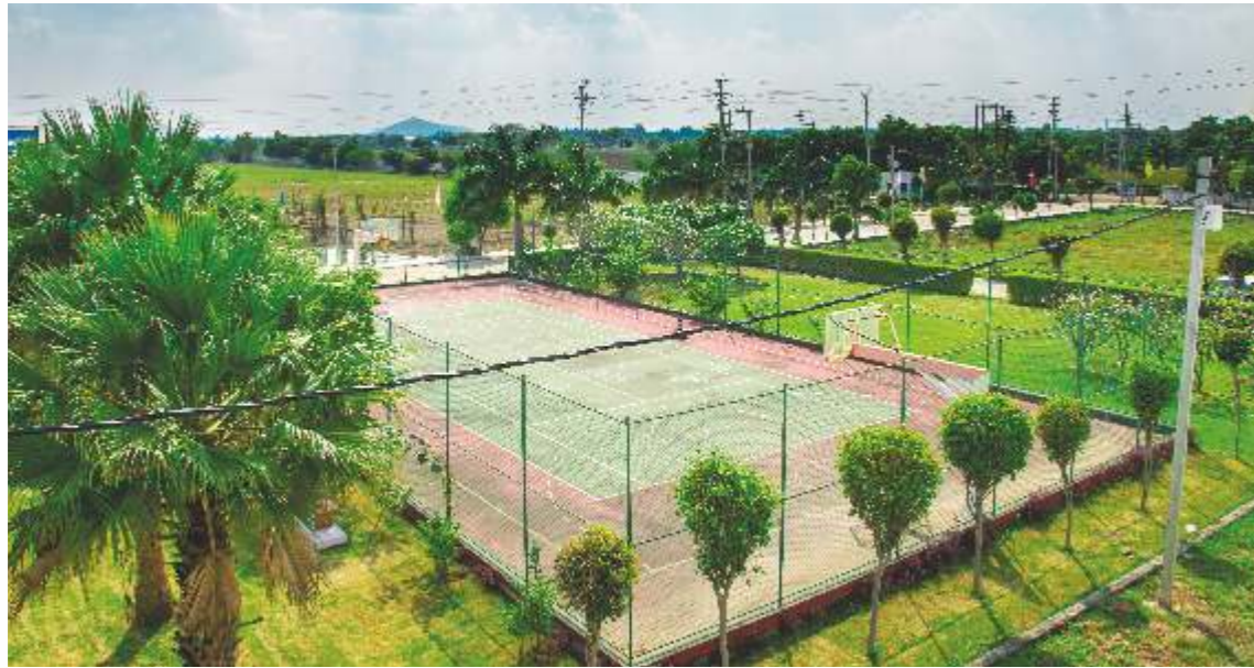
Outdoor games court