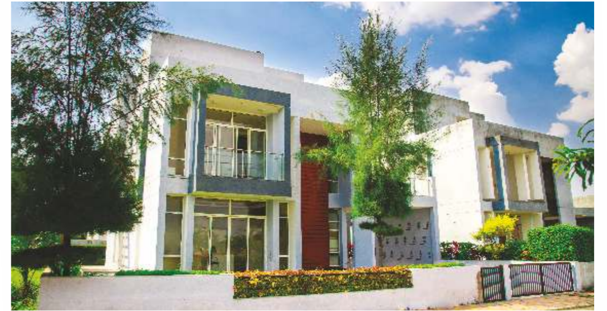
Ready possession villas

75 Acres | 15 XL gardens | 700 Happy families